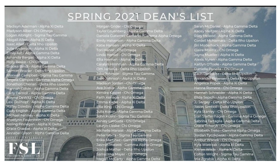
Ten DRU Actives made the Dean's List last semester!

I am sure that many of you are wondering how the Delta Rho Upsilon fraternity active body is doing. It has survived. The officers have worked extremely hard to keep a social organization alive even though they were not allowed to meet socially. The pandemic has taken a toll on the membership of the organization. They went from a pre-pandemic membership of over 40 members to now having a membership of 13. For the last two years they have actually been in survival mode. Although they have been able to take small pledge classes each semester last year, many of the active members have not returned to the school. This semester they took 5 new pledges. The Active Body is a relatively small group but they are very tight and have a goal of maintaining the organization. Several times at a recent meeting, they articulated their desire to make it to the 100<sup>th</sup> Anniversary in 2029.